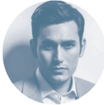
Arifin Putra Actor